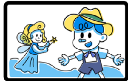
④ Enter the story and become the main character of the story.